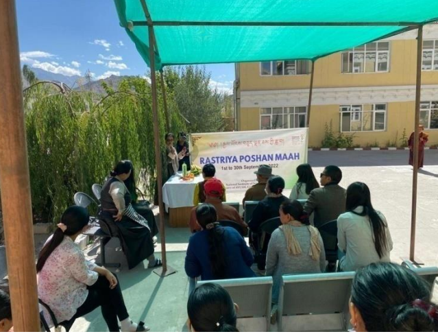
September 2022 Poshan Maah Celebrated in NISR, Leh Office campus.