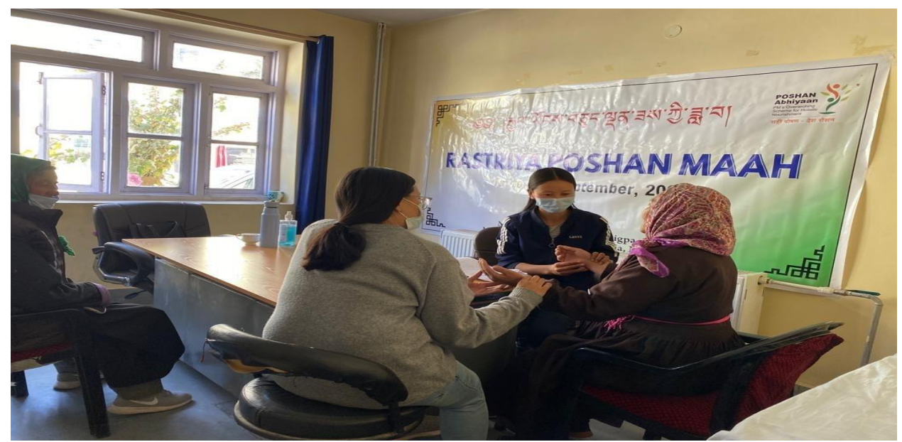
NISR, Leh OPD celebrated Poshan Maah for whole month of September 2022. It was appreciated by all the people who attended the institute during the "PoshanMaah" and the programme was very successful.